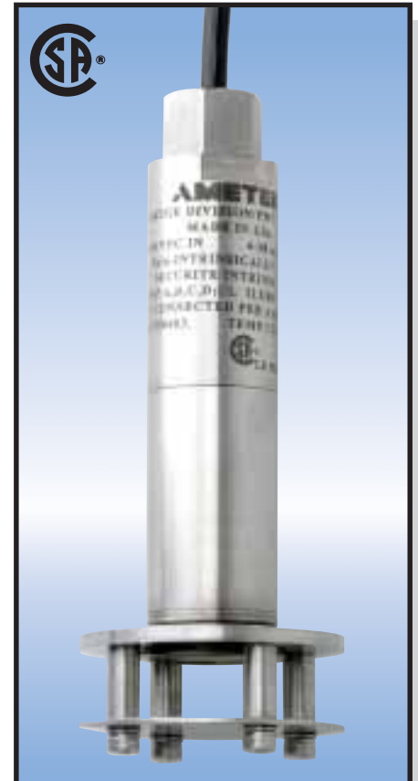
MODEL 575P TRANSMITTER INTRINSICALLY SAFE

for any span needed, from 0 to 3 psi or 0 to 0.2 bar (0 to 7 feet or 0 to 2.1 meters of water) to 0 to 300 psi or 0 to 20 bar (0 to 690 feet or 0 to 211 meters of water).